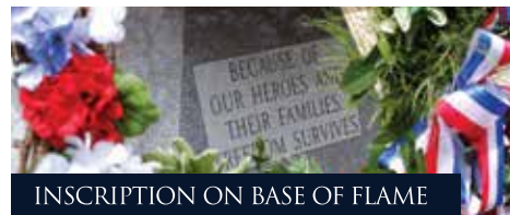
INSCRIPTION ON BASE OF FLAME