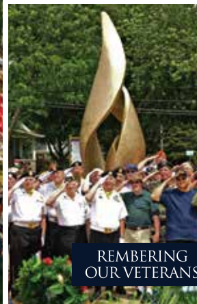
REMEMBERING OUR VETERANS